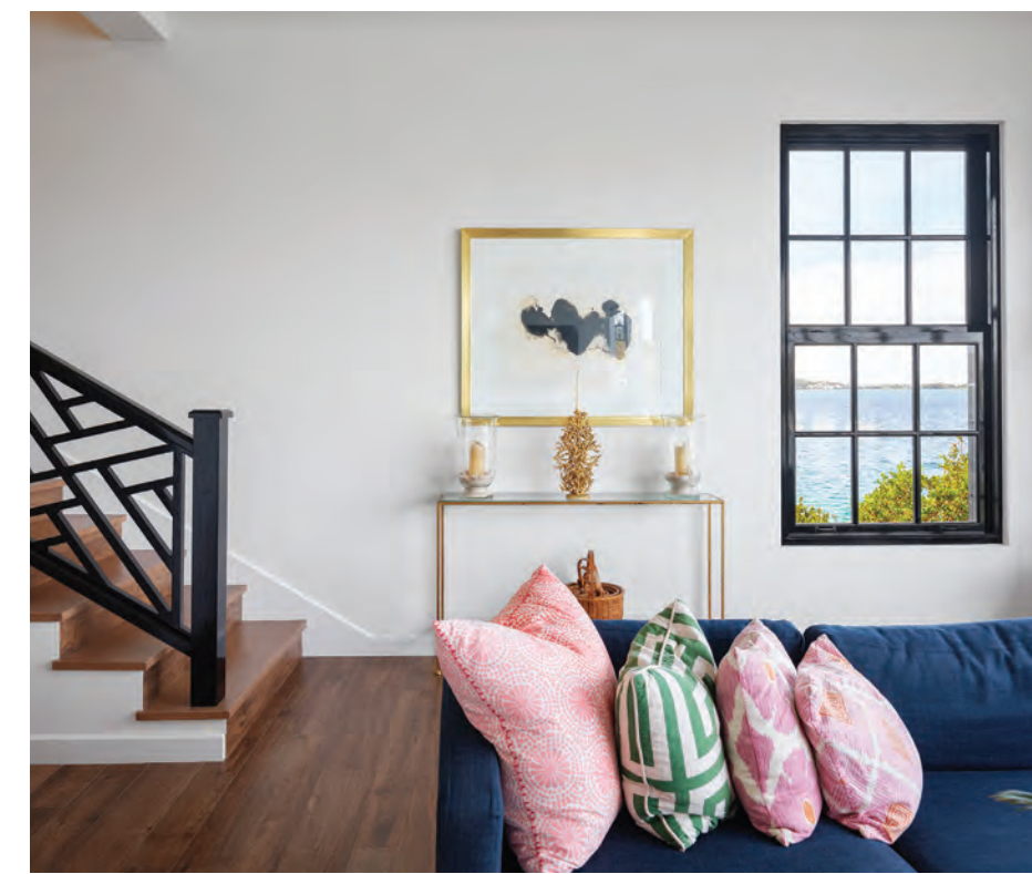
Situated between a main road and Harrington Sound, you would imagine Southside to be narrow and noisy, but from the minute you enter the home, you're blown away by the breathtaking views and serene silence.

The plot location and coastal landscape made for considerable challenges when designing Southside, but, says Benevides, the owner had a vision and commitment to this property. The actual construction took two years, but before the design for the house could begin, they had to do a coastal environment and landscaping plan. "That was major," she continues. "There were three caves. I had to design the house around the caves." Two caves are over on the west of the property, what is now the parking area,