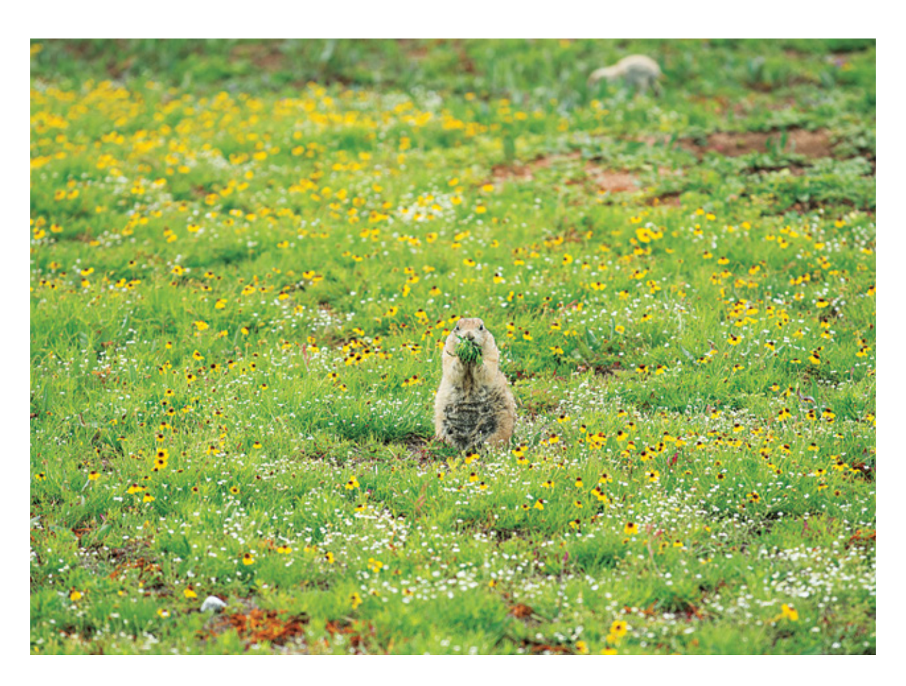
Prairie dogs are some of the refuge's most visible and vocal residents.

∢ In autumn, post oak and blackjack oak create a vivid color palette within the Wichitas' forest.