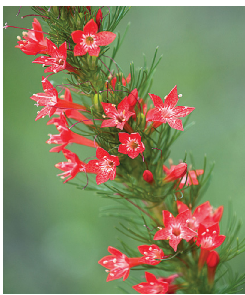
▲ Wildflowers like this standing cypress are abundant throughout the Wichitas in spring and summer.

▼ The 20,000 red cedars planted in the 16-acre area now known as the Parallel Forest were originally intended to be lumber for fence posts, but the project was abandoned after the land was incorporated into the refuge.