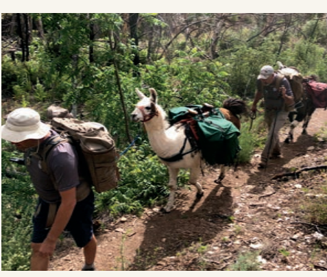
With the help of numerous groups including the U.S. Forest Service and Trout Unlimited, along with a few pack llamas, staff from the Kingman region and Native Trout and Chub program moved 196 Gila trout upstream after observing the fish in a part of Grapevine Creek that typically goes dry in the summer. In 2019, Gila trout eggs were introduced into the creek, and the eggs hatched and the fish were doing well. The relocation of the fish to the uppermost reaches of the perennial water was a proactive move to support the population.

AZGFD photographer George Andrejko covered many miles in Arizona taking photos of wildlife at water catchments, on-the-ground conservation work and sheltering in blinds as the ultimate form of social distancing.