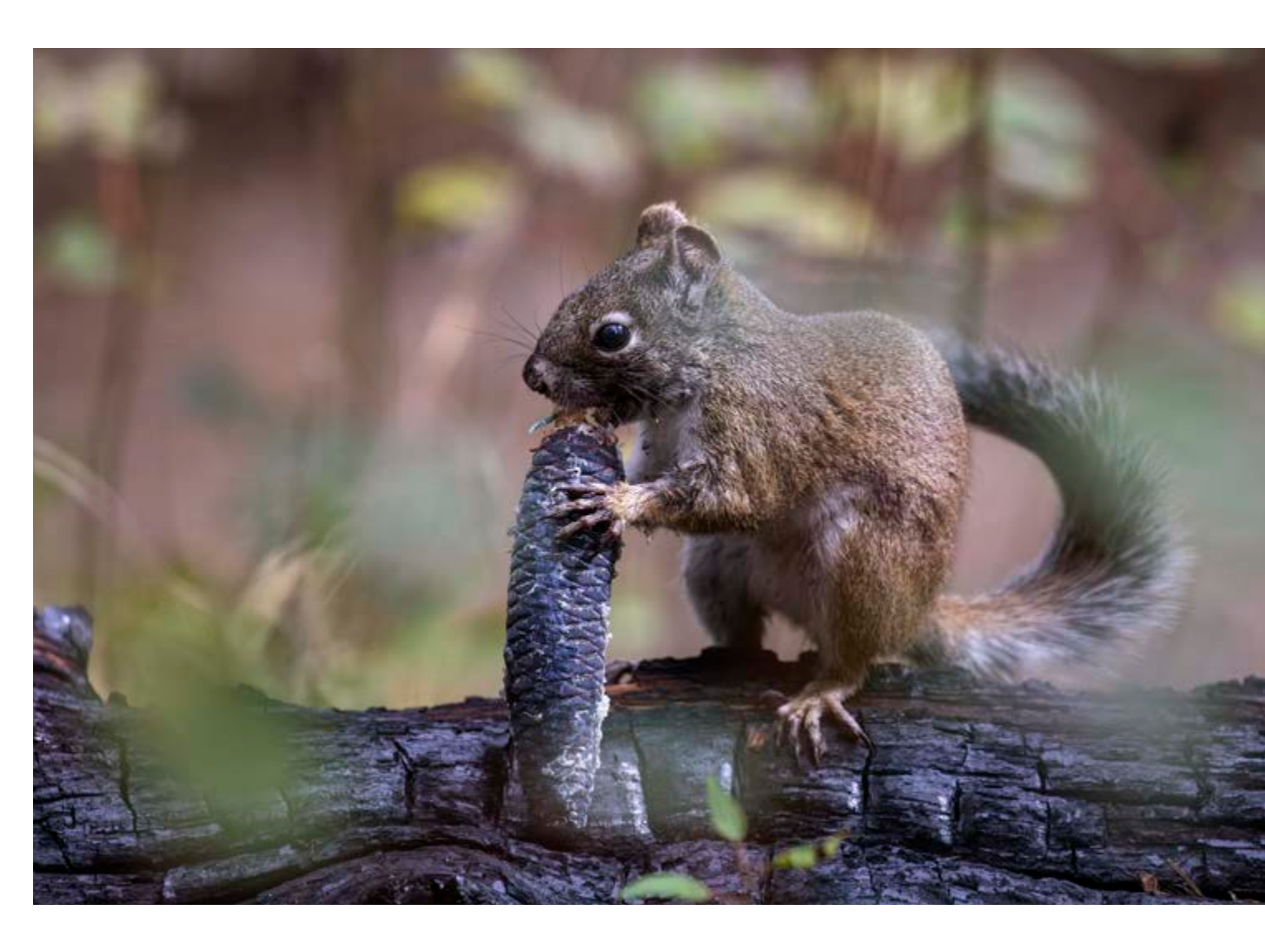
A Mount Graham red squirrel nibbles on a corkbark fir cone while perched on a log burned in the 2017 Frye Fire.

HE NEXT DAY, I hike in a mixed-conifer forest above Riggs Flat Lake with Alanen and Forest Service biologist Angela Dahlby. Once we get past a severely burned slope, we enter a wooded area full of mature trees that escaped the fire. Our goal is to visit old midden sites and see if red squirrels have