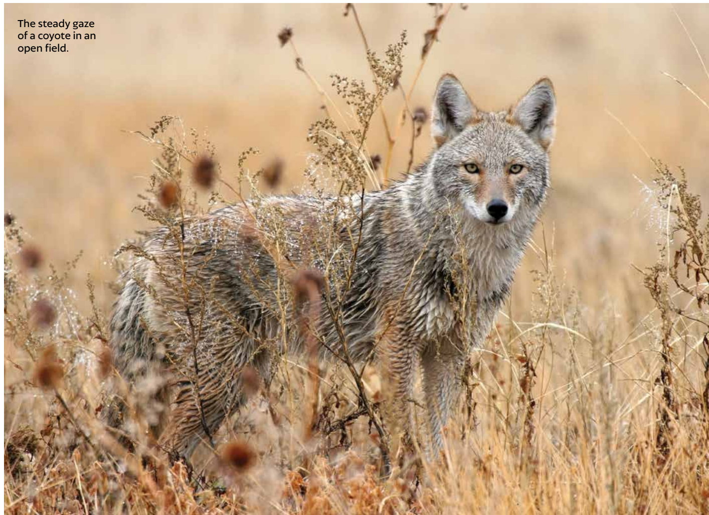
The steady gaze of a coyote in an open field.

Difficult as it is to bump politics from the headlines these days, coyotes can manage it. In the spring of 2015,