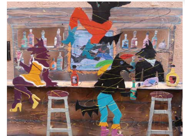
Clockwise from top left: Through the ages, coyote images have graced New Mexico petroglyphs, Saturday-morning TVs, paintings in Santa Fe's Coyote Cafe, and Howl and Pounce , a sculpture by Don Kennell.

patrons of a bar in the New York borough of Queens—that's right, the interior guts of our largest megalopolis—heard a sound overhead as they exited the building. A dozen feet above them, looking down curiously on afternoon street traffic, was a healthy coyote. In a pause between firing smartphone photos, one of them called animal control. But when the official van rounded the corner a few minutes later, the coyote glanced, whirled, and disappeared through the broken window of a nearby building, just like any garden-variety superhero.