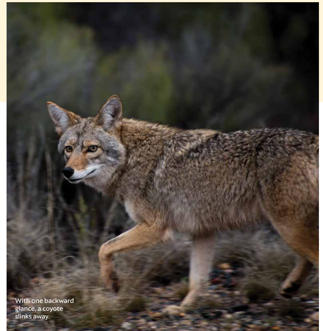
With one backward glance, a coyote slinks away.

Which means—and why do things like this surprise us?—that if you want to live in America, you need to get along with coyotes. I'll go further: You need to appreciate them as