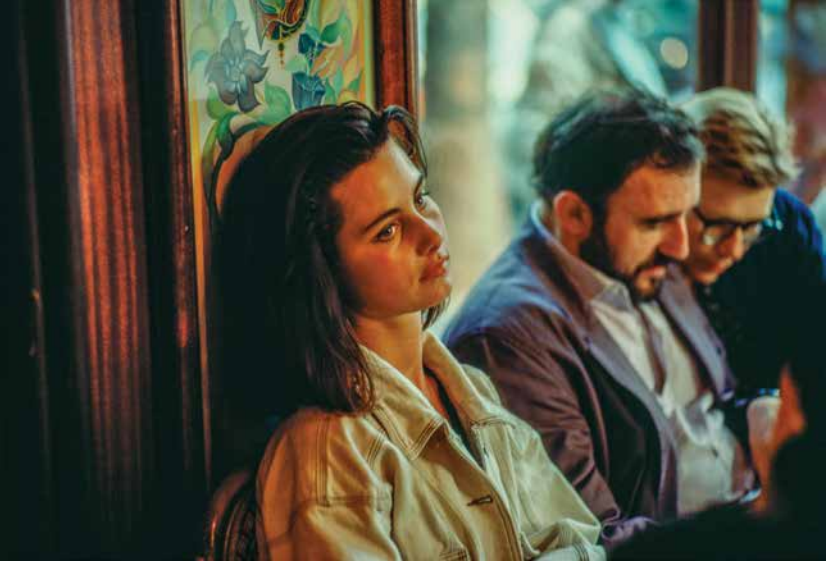
Place Saint-Michel, 2016

"I've always been drawn to the edges of an event or a place, whether it's meandering the streets of a city neighbourhood, frequenting a visually beckoning cafe or bar, roaming the cavernous rooms of fine museums, or probing the wings and the backstages at music events or fashion shows; that's where I love to visually explore. Just about anywhere I go in search of pictures, I go serendipitously. And Paris is the most serendipitously generous city I've been fortunate to visit in my life."