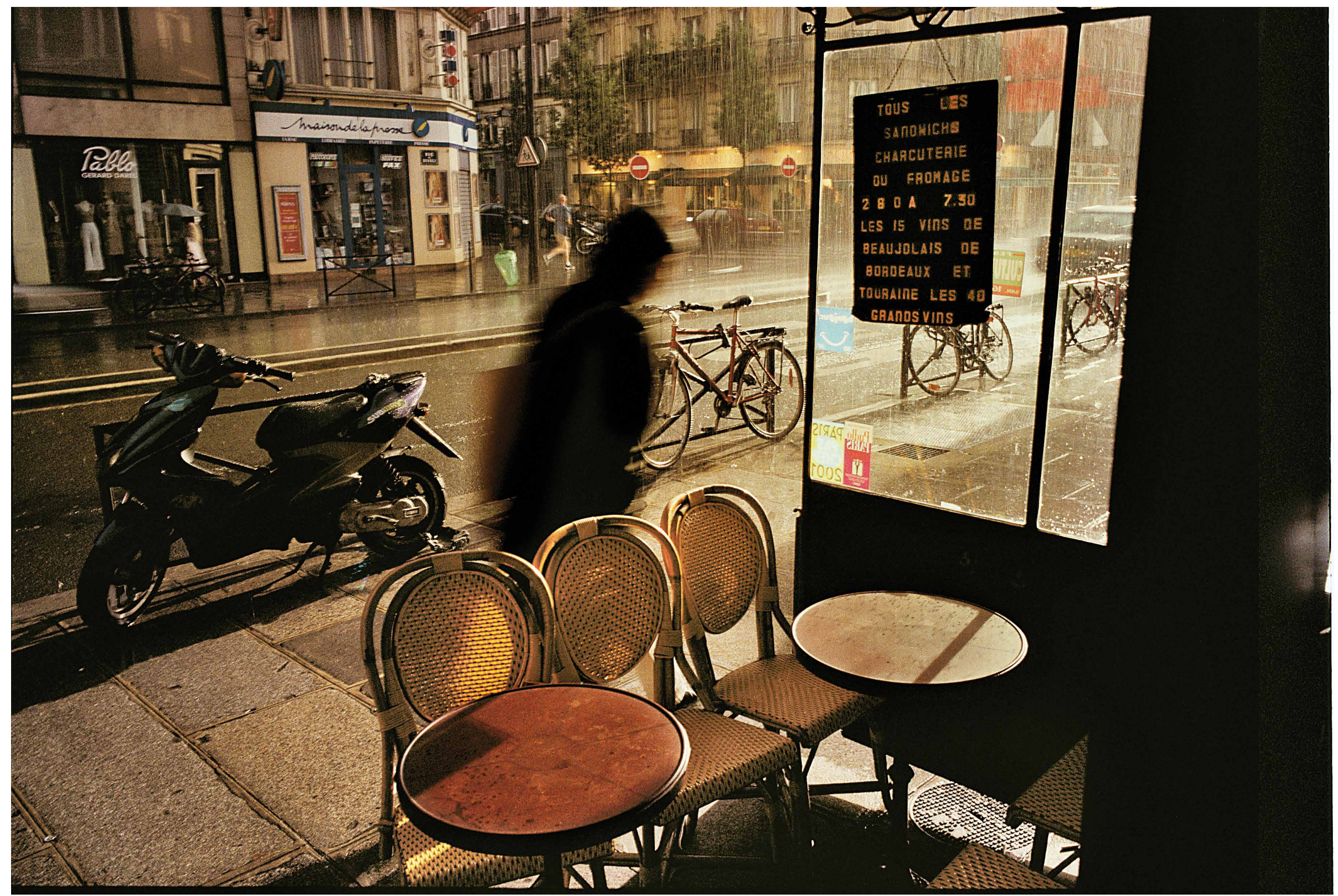
Rue de Rivoli, 2002