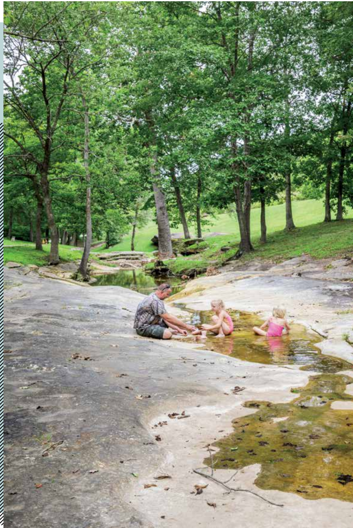
PAGES 36-37: A wall made of stone arches separates the roadside park at Courtois Creek from Route 8 in Crawford County. Travelers can hang out at the fire pits, ovens, benches, and picnic tables. It's one of the 10 roadside parks built in 1936 as part of the New Deal program.