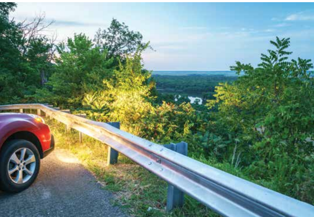
Visitors are treated to a beautiful view of the Mississippi River floodplain from the roadside park at the DuPont Reservation Conservation Area in Pike County. The park is tucked against the Little Dixie National Scenic Byway (Route 79), which runs through the middle of the conservation area.