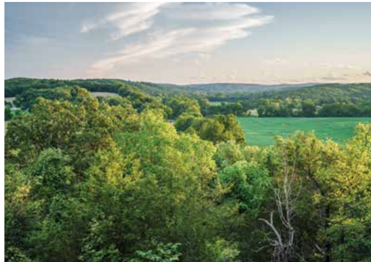
Looking over the Fourche a du Clos Valley, the park on Highway 61 in Ste. Genevieve County was built in 1936 for only $2,300. The original rustic-style log fences were removed recently, but there's still a stone oven, a stone wall, and several picnic tables available.