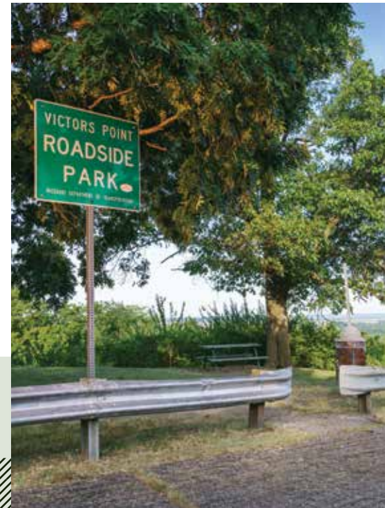
RIGHT: Like many roadside parks in Missouri, Victors Point on Route 79 in Pike County offers spots to sit, eat, and enjoy the stunning views.