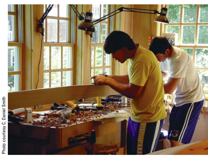
As the boys grew, they learned the value of working in tandem, hand planing over 600' of western red cedar.

cabinetry. I learned about strongbacks and sheerlines, and about learning to trust my eyes and hands to develop the gentle curve of a hull. The setup may be squared and trued, but the development of a complex curve is the aesthetic perfection that becomes a boat. My two sons were toddlers, but they were exposed to the process. And it was therapy for me as I dealt with my father's eventual passing.