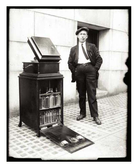
A victrola housed a hidden liquor cabinet, seen here after a Portland bust in 1922.

"I have done more to enforce the laws relating to the unlawful transportation and possession of liquor than any other officer in Hancock County, and possibly more than any other customs