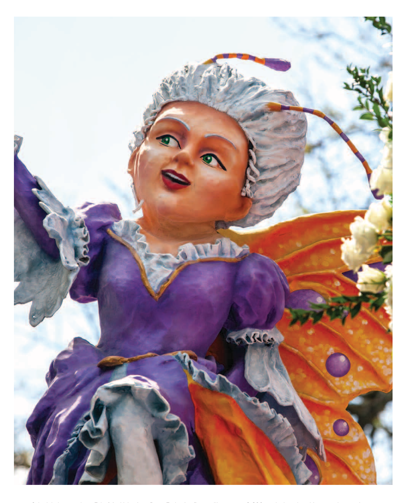
Scheduled to parade on Feb. 14 – Valentine's Day – Endymion floats will carry over 2,800 masked revelers this year, who promise to bombard the the enthusiastic crowds with millions of strands of Mardi Gras beads and Endymion 2015 collectible throws. The party continues after the parade is over at the Endymion Extravaganza at the Mercedes-Benz Superdome, which hosts country singer Luke Bryan as the headlining act.