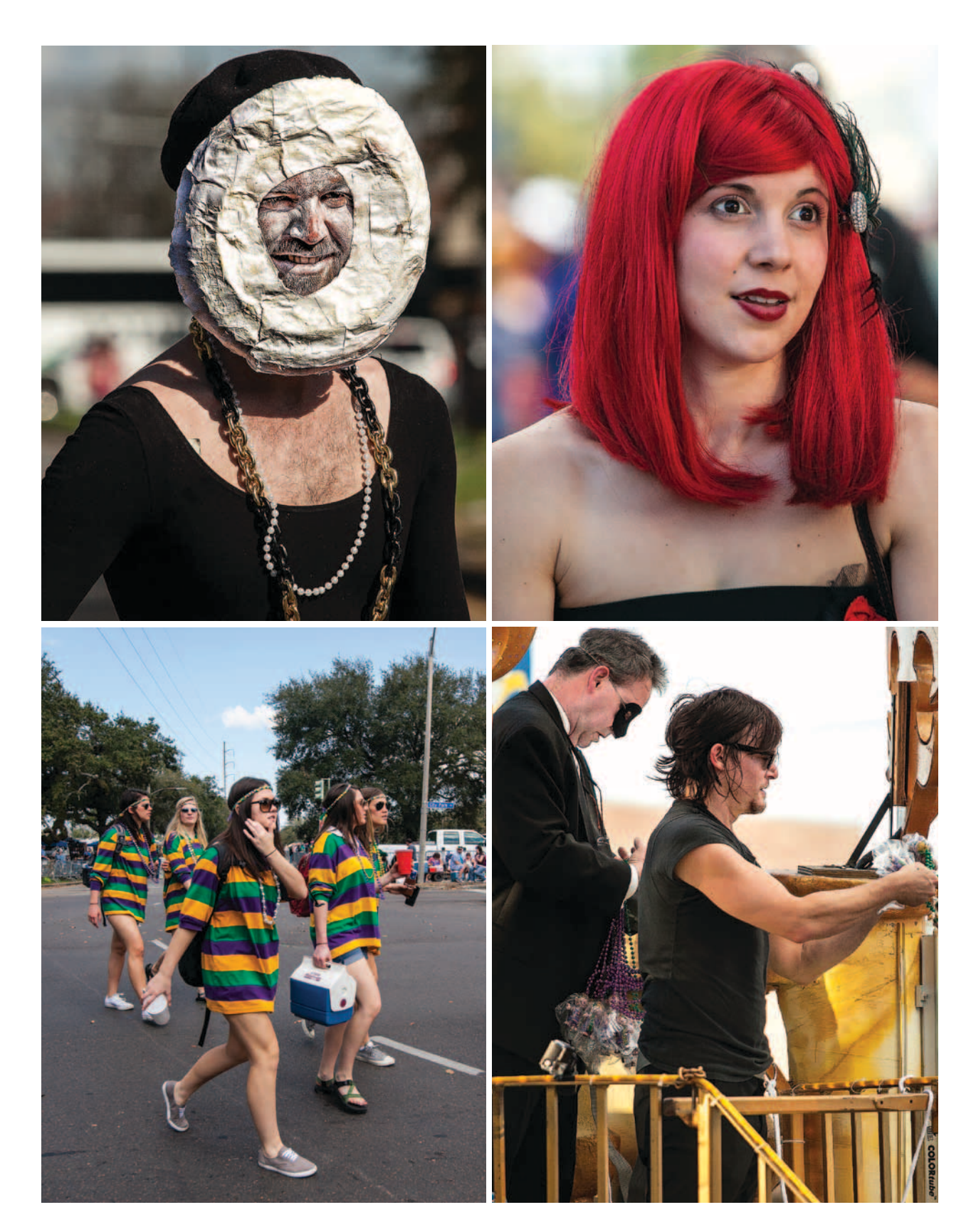
Endymion Saturday (some refer to it as "Samedi Gras" or "Fat Saturday") in New Orleans is more of a street festival than a mere parade. Continuing until well after sunset, it makes for colorful people-watching, as the witnesses themselves are very much a part of the spectacle. With humble beginnings back in 1966, its founder Ed Muniz oversaw exterme growth in the krewe as it charged to the top of the Carnival scene by the mid-'70s. During the parade, the entire neighborhood is gridlocked by traffic and barricaded as early as 2 p.m. Some hardcore partygoers even camp out on the neutral ground the night before to ensure that they get a good spot for bead-catching. Like other krewes, Endymion has a royal family, although though the king is not a celebrity but a krewe member. Endymion does host celebrities atop its floats, though. Last year, Walking Dead actor Norman Reedus made an appearance as a Grand Marshal (pictured on this page in the bottom right photograph).