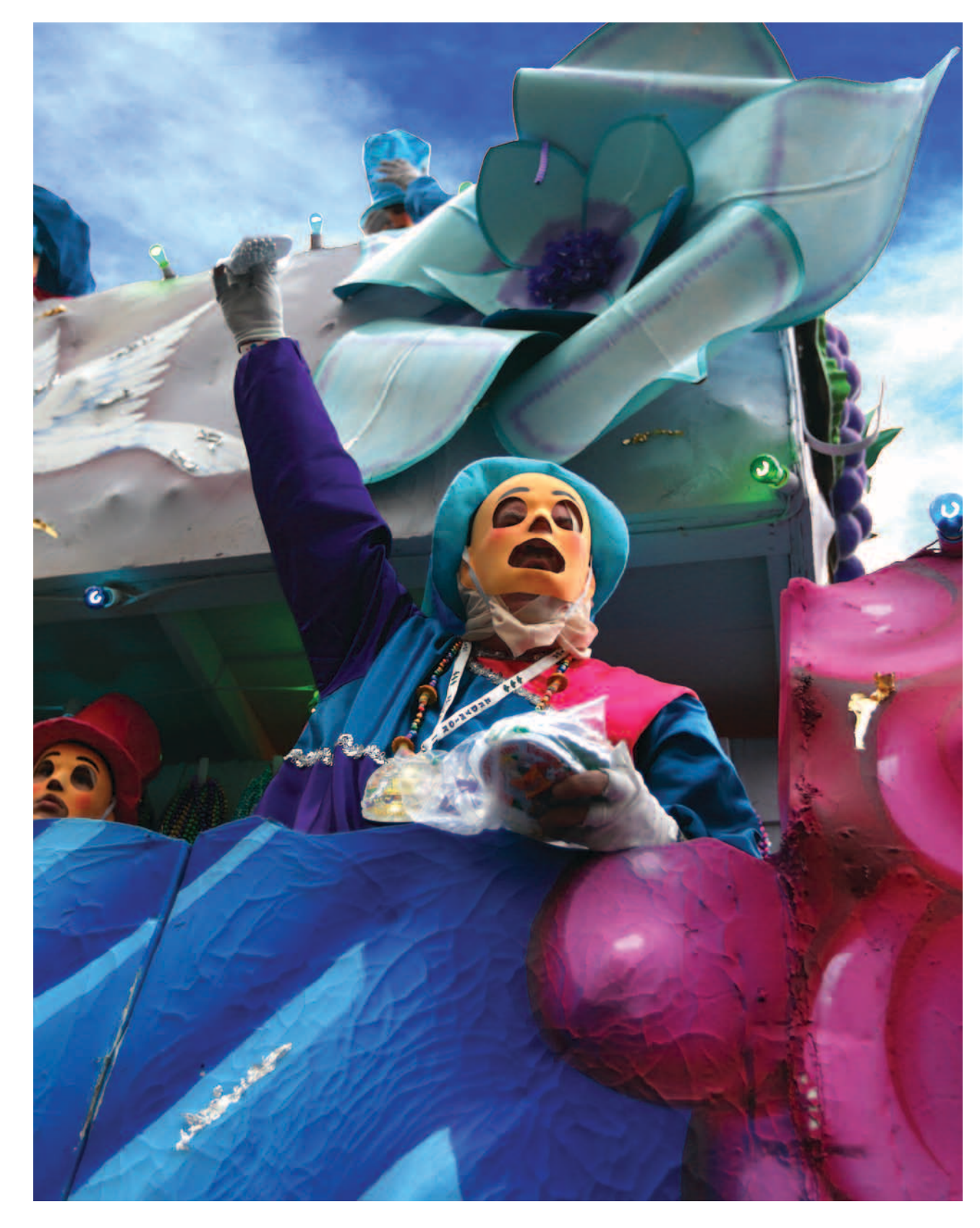
The Krewe of Endymion begins its route at City Park and Orleans avenues, rolling through the Mid-City neighborhood all the way to St. Charles Avenue in the Central Business District. Along the way, it maintains momentum with the help of its energetic incorporation of dance teams, marching bands, flambeaux and other marching groups amongst its various-sized floats. For Endymion, mini-floats are just a prelude to the larger segment of the parade to follow.